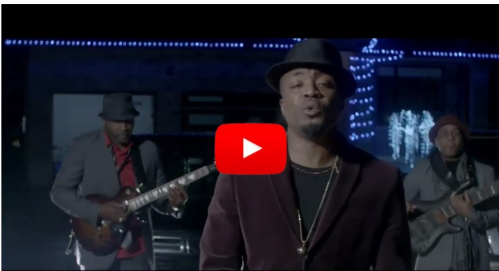
CITYSOUL - DANCE WITH MY FATHER