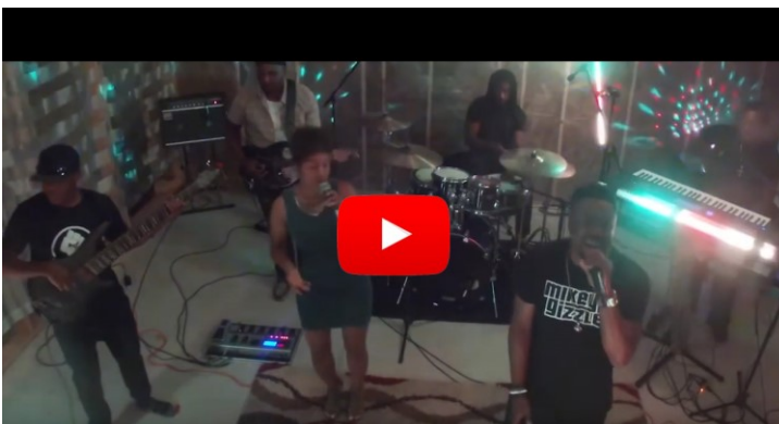
CITYSOUL - BASEMENT REHEARSAL