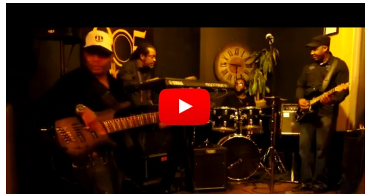
CITYSOUL - PLAYING AT 905 RESTAURANT